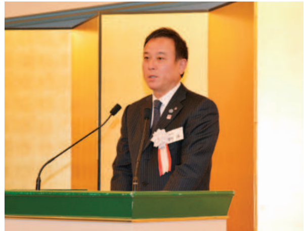
Congratulatory remarks from Wataru Kurihara, Chairperson of the Fukuoka Prefectural Assembly