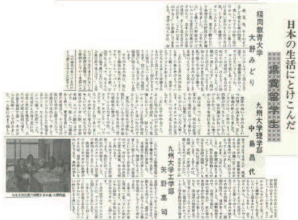
ブラジル 矢野 高司 中島 エウザ 昌代 大野 みどり