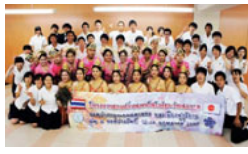
▲Bangkok high school student visit (Yanagawa High School)

State of Hawaii (USA), Jiangsu Province (China), Bangkok (Thailand), Delhi (India), Hanoi (Vietnam), Southern Coastline of Korea (1 City, 3 Provinces)