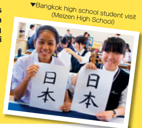
▼Bangkok high school student visit (Meizen High School)