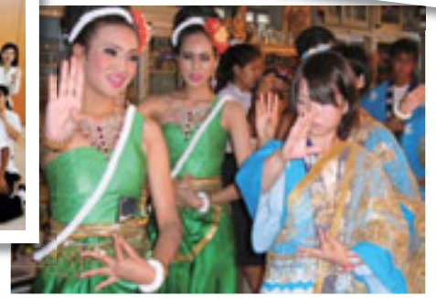
▲Fukuoka high school students visit Bangkok