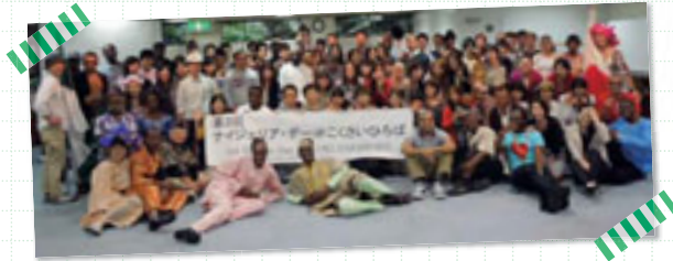
Last year's Nigeria Day

A showcase of fascinating Nigeria by Kyushu's resident Nigerians! Participants of all ages can enjoy games and songs, as well as trying on native dress. Come and experience Nigeria at Kokusai Hiroba!