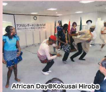
African Day@Kokusai Hiroba