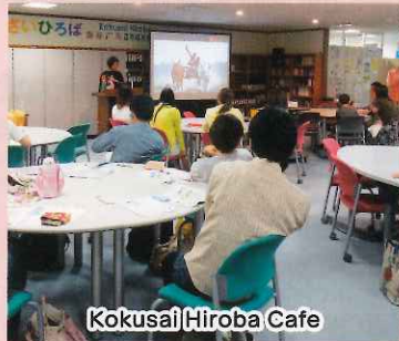
Kokusai Hiroba Cafe

A place where many can come together and talk, regardless of nationality. There are also regular Japanese language classes for foreigners, and events that offer a taste of the world.