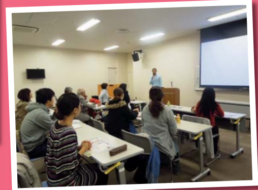
Guest Teacher Skill Improvement Seminar