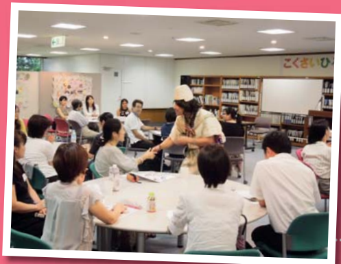
Model Lesson Presentation