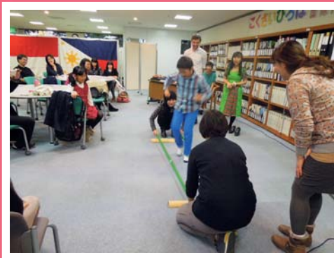
Kokusai Hiroba Cafe