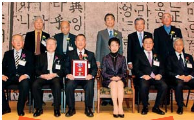
Receiving the Prince Takamado Award