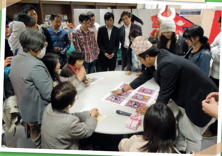
Kokusai Hiroba Café - Asia