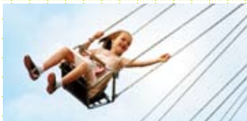
Karo and God himself

Organized by representative bodies for the European Union in Japan and the embassies of EU member nations, "EU Film Days" is a festival to showcase the variety and quality of European cinema. From films not previously shown in Japan to popular recent works and enduring masterpieces, the festival will screen 7 films from 7 countries.