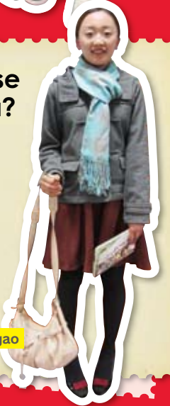
Some of the visitors to Kokusai Hiroba