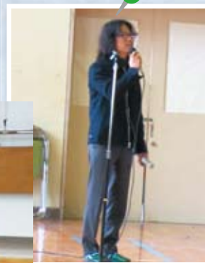
▲A final message for the Junior High Students