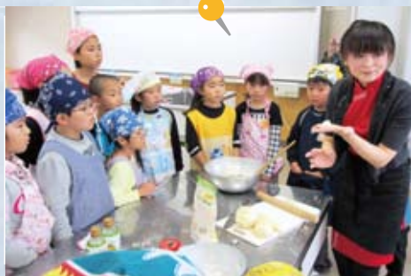
▲Let's make sui-gyoza, a new years favourite in China!

Experience Chinese food culture and deepen understanding of neighboring China through interaction.