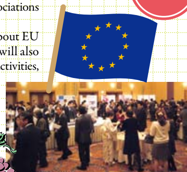
Last year's event