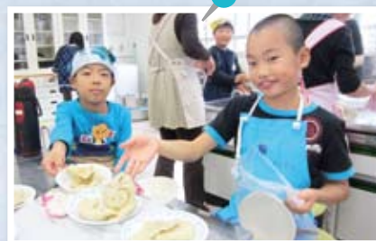
▲Arranging the gyoza into Xiaolongbao (a steamed bun from eastern China)