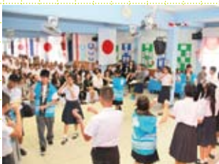
High school student exchange in Bangkok

In August this year, high school students from within the Prefecture were for the first time sent to Bangkok as part of a program run by the Fukuoka International Exchange Foundation. What did the 6 students experience, think and feel during their stay? Come and hear the students' real impressions!