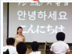
Firstly, a self-introduction in Korean.

At the same time, aiming to deepen recognition of the students' own country through hearing outside impressions of Japan.