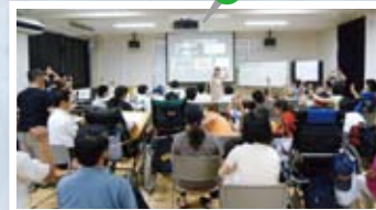
Everyone practicing the rhythm of the Janggu (Korean traditional instrument).

The students had a keen interest, and the questions were flying.