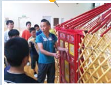
Working together to build a yurt.

Learning, through experience, the virtues of Inner Mongolian culture and the lifestyle in which it is deeply rooted. Also, by listening to the stories of teachers who are engaged in international cooperation activities, students gain a sense of the importance of taking action and finding out how they can play a part.