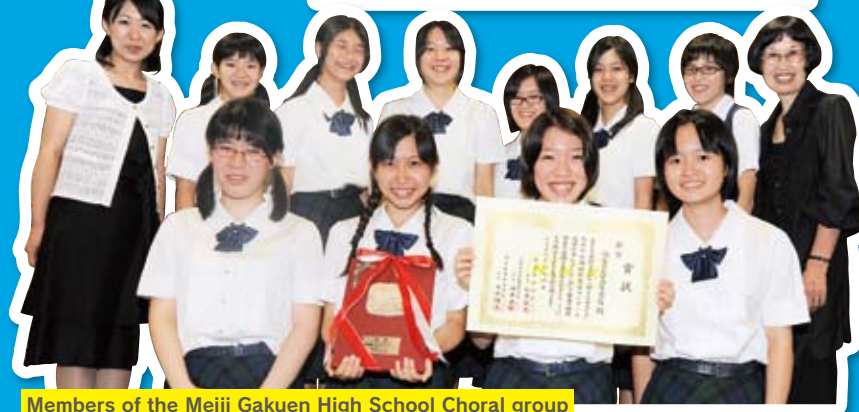
Members of the Meiji Gakuen High School Choral group