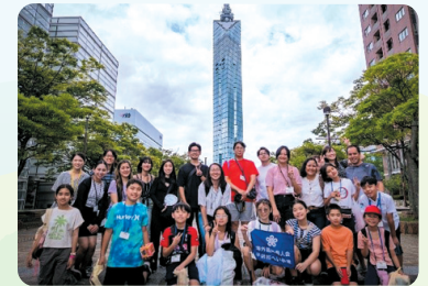
Short Term Visit Program Conveying the charms of Fukuoka to the next generation of Fukuoka descendants