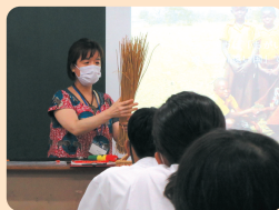
A glimpse of a past lecture

At the Foundation, we send lecturers to schools and public offices all over the prefecture to hold lectures about their life experience in other countries, as a way to teach children and adults about the world.