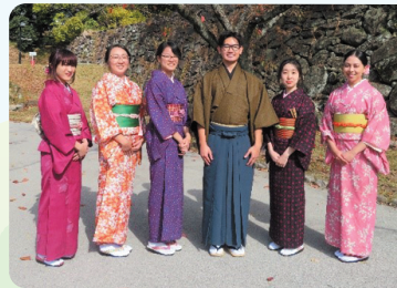
Kimono, Tea Ceremony, and more Experiencing Japanese culture first hand

Each year, as part of the Exchange Student Program for Descendants of Immigrants from Fukuoka Prefecture, descendants of members of the Worldwide Fukuoka Kenjinkais have a chance to spend a year studying abroad in Fukuoka. This year, from April 2024, there are 7 participants from 7 Kenjinkais, from a total of 6 countries around the world: Brazil, Paraguay, Bolivia, Mexico, Peru, and America! As well as being able to study specialist subjects and technology at universities in Fukuoka Prefecture, they also get the chance to deepen their understanding of Fukuoka Prefecture's traditions, culture, industry, and business!