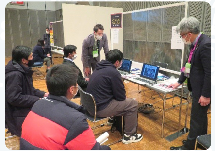
A glimpse of last year's Information Session

Students can get useful information directly from the staff of various companies. International students looking for employment in Kyushu shouldn't miss it!