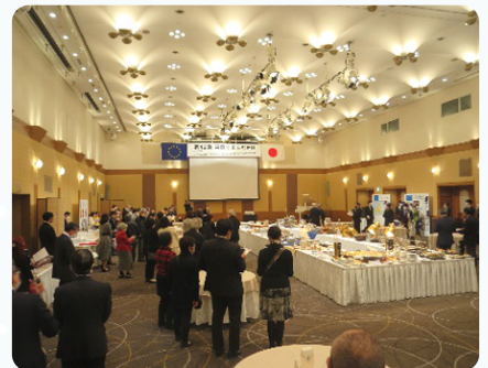
A glimpse of year's event

In collaboration with the (EU-Fukuoka Friendship Association). Enjoy the speciality dishes and wines of various EU countries whilst listening to music. The participating organizations will also give updates on their latest activities, so you can get that EU feeling.