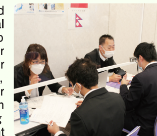
At the Company Information Session

FiSSC holds regular seminars and other events to advise international students in Fukuoka about job hunting, and help them search for full-time employment. In December 2021, FiSSC held an event, 'Company Information Session for Students Seeking Employment in April 2022', introducing international students to 16 different countries in Fukuoka Prefecture.