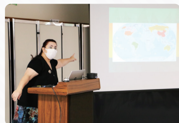
A glimpse of a past lecture