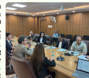
Attracting International Students (India)

To draw international students with a high level of Japanese to Fukuoka Prefecture, FiSSC is collaborating with Japanese language schools in country, as well as Former International Student Associations of various countries. We share information about student life in Fukuoka and about our member universities, as well as sharing the experiences of current international students in Fukuoka.