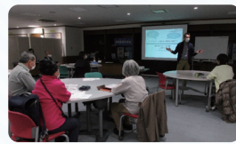
A glimpse of the course

We carry out "Skill-Up" courses for the volunteers who hold Japanese classes, as well as for anyone interested in Japanese language education. This year, we held the "Teaching Japanese to Complete Beginners" course, the "Reasons for Japanese Learners' Unnatural Speech Patterns" course, and the "How to Master Technology in Teaching" course. Each course had 1 online and 1 in-person lecture, for a total of 6 lectures.