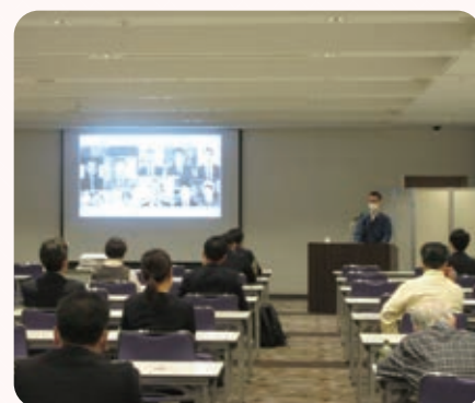
A glimpse of the seminar

Hey! We are the Fukuoka International Student Support Center! Located within the Fukuoka International Exchange Foundation. While cooperating with Fukuoka universities and local governments to provide various support to international students, living consultations, job hunting, introducing part time jobs, and exchanges with Fukuoka residents. Here is FiSSC Report no.9!