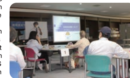
A glimpse of the seminar

We received comments such as, "It was good to learn more about disasters in Japan. We hope to attend more seminars in the future, and engage more," from the participants. The next "2nd Seminar on Disasters 2022" is scheduled to be held at Kokusai Hiroba, located on the 3rd floor of ACROS Fukuoka, from 00:00 on Sunday, 29th January, 2023.