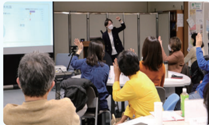
Photos of the classes

In order to provide opportunities for people to learn about and think about the world, we regularly dispatch and introduce foreign instructors and Japanese instructors with experience working overseas to schools and community centers in the prefecture, hold skill improvement courses for instructors, and hold international exchange events for children and adults.