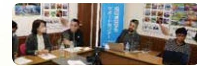
Overseas PR (India)

In cooperation with excellent Japanese language schools overseas and in Japan, we hold study abroad information sessions to provide information on universities and living environments in Fukuoka Prefecture.