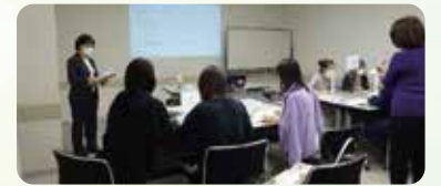
*Job Hunting Seminar

We support networking and exchange among former Fukuoka international students who are active in Fukuoka and their home countries so that they can continue to connect with the friends they made while in school even after graduation.