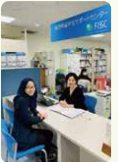
*Consultation on daily life

FiSSC is open on Saturdays, Sundays, and national holidays (10:00-19:00) except during the year-end and New Year holidays, so you can feel free to consult with us about any questions or concerns you may have about your daily life. FiSSC also provides free introductions to part-time job opportunities for international students in the prefecture.