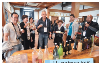
Hometown tour (Fukuoka)

Kenjinkai members will visit their hometowns in the hometown tours that located in 4 regions within the prefecture (Fukuoka, Kitakyushu, Chikugo, Chikugo). The Kenjinkai members got to enjoy their hometowns and got to interact with each of their municipalities.