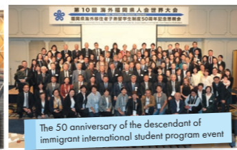
The 50 anniversary of the descendant of immigrant international student program event