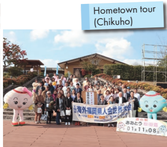
Hometown tour (Chikugo)