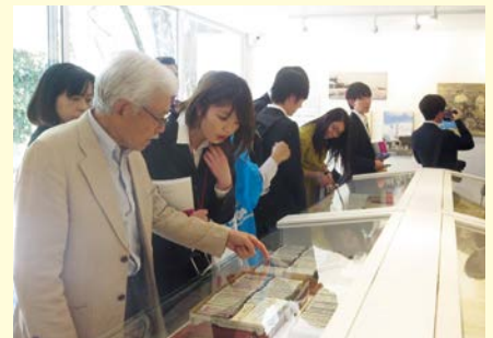
Mexico (Tour of AKANE Museum of Japanese Immigrants to Mexico)

Myanmar Training Debriefing Session Sun, March 31, 2019, 14:00 ~ 15:00 at Kokusai Hiroba (ACROS Fukuoka, 3F)