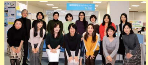
Consultation Desk Staffs

The consultation desk is open seven days a week (10:00-19:00) except year-end and New Year holidays. Please visit us any time if you have questions or troubles about studying abroad.