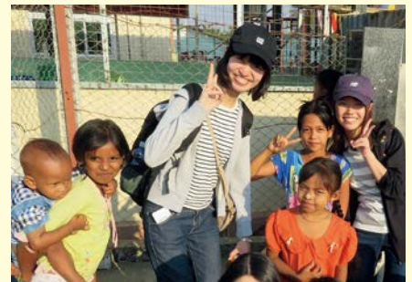
Myanmar (Cleaning up the region with children from Myanmar)