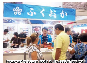
Fukuoka Prefecture booth at the "Japan Festival"