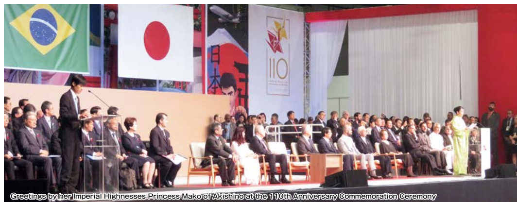
Greetings by her Imperial Highnesses Princess Mako of Akishino at the 110th Anniversary Commemoration Ceremony

For three days from July 20 to July 22, the Japan Festival, which is the world's largest nikkei festival promoting Japanese food and culture, was held concurrently with the commemoration ceremony. The delegation also set up its own booth, offering Yame tea tasting and local specialties from different regions of the prefecture. Furthermore, the booth carried out tourism promotion of Dazaifu and offered "Plum wine" and "Umegae mochi" (red bean paste mochi) to visitors.