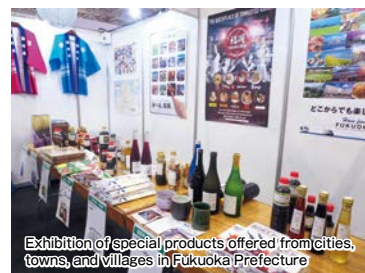
Exhibition of special products offered from cities, towns, and villages in Fukuoka Prefecture