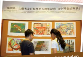
Japan-China Children Friendship Painting Exhibition

Last year, we celebrated 25th year anniversary of the friendship agreement which was signed with Jiangsu Province China in 1992. To commemorate this, Japan-China Friendship Painting Exhibition (painted by elementary school students from both regions) was held in July last year at Kokusai Hiroba.