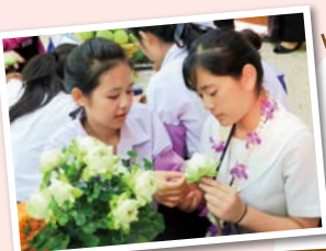
Exchange with Bangkok

High school students from Bangkok visit Fukuoka Prefecture in May every year, and high school students within the prefecture are sent to Bangkok in August every year. Exchange with local high schools, homestays, cultural experiences and other activities are conducted in both regions.