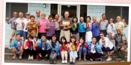
Youth Mission Program to Kenjinkai in Hawaii State