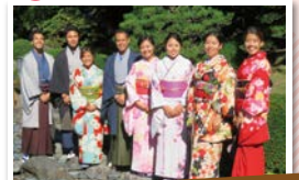
'Descendants of Immigrants' Exchange Students

Kaigai Fukuoka Kenjinkai organized by emigrants whose hometowns are within Fukuoka Prefecture currently exist in 23 countries and 38 regions. They are valuable assets as they act as a bridge to connect the prefecture with each country and region, and play an important role for exchange with abroad. FIEF carries out various projects, such as sending a mission to attend each Kenjinkai's anniversary event, hosting youths from immigrant families, dispatching youths within Fukuoka abroad, holding seminars with invited guest speakers who are from Fukuoka Prefecture and are active overseas, and others to train successors for each Kenjinkai and to strengthen the Kenjinkai networks.