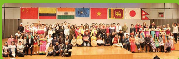
◀Fukuoka Overseas Students Association Cultural Show 2017