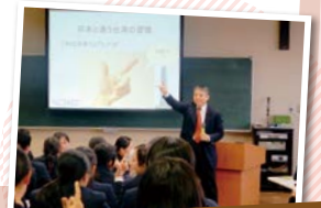
Seminar by the chairperson of Taiwan Kenjinkai