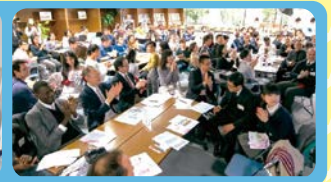
▲Exchange Event for FiSSC 10th Year Anniversary