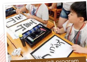
Short-term visit program for Kenjinkai youth (Elementary school students)