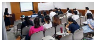
Advanced business Japanese language seminar

We provide comprehensive supports for international students seeking employment in Japan by conducting enterprise introductions, employment support seminars, as well as by providing opportunities for exchange with former students who have already found employment in Japanese enterprises.