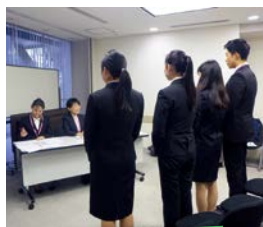
Career Support Club

We run the job matching website 'Work in Kyushu ( http://blog.kghrpc.org/ )' for the purpose of matching enterprises and international students in Kyushu directly, and to support international students' job hunting and enterprises' recruitment activities.