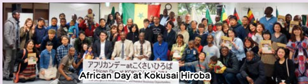
アフリカンデー at ことさいひろば African Day at Kokusai Hiroba