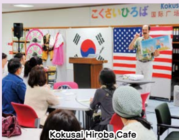
Kokusai Hiroba Cafe

An exchange space open for everyone regardless of nationalities. It is a place where you can feel the world as well as participating in different kinds of international exchange events.