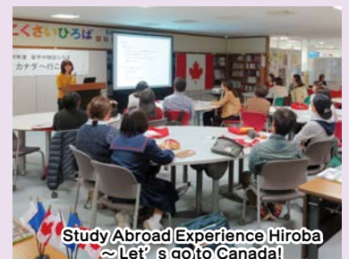
Study Abroad Experience Hiroba ~ Let's go to Canada!