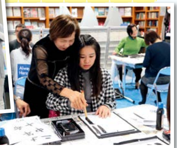
▲ Japanese Culture Seminar 'Kakizome (the first calligraphy of the year)' experience