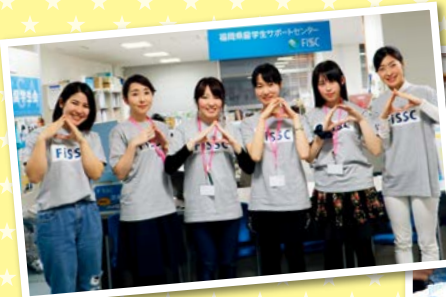
◀ Student Volunteer Staff Members 'Omusubigumi'

Facebook: https://www.facebook.com/fukuoka.fissc