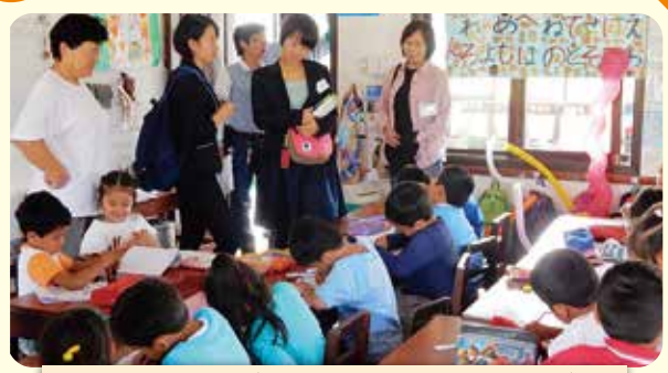
Global Stage (2015・Bolivia/School visit)

Contact Fukuoka International Exchange Foundation, Planning & Exchange Division TEL 092-725-9204 FAX 092-725-9205 Email exchange@kokusaihiroba.or.jp