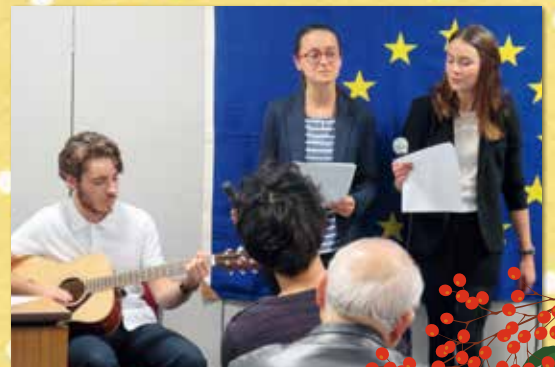
EU Christmas (Fukuoka EU Association, EUIJ Kyushu)