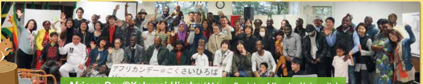
African Day@Kokusai Hiroba (African Society of Kyushu University)