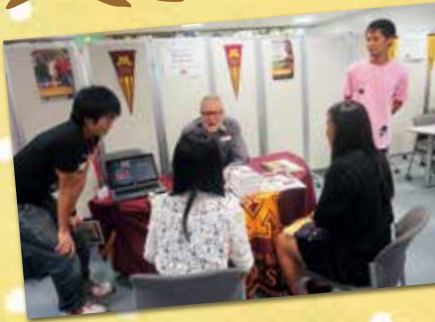
Study-Abroad Experience Hiroba - Study in America! (Fukuoka American Center)