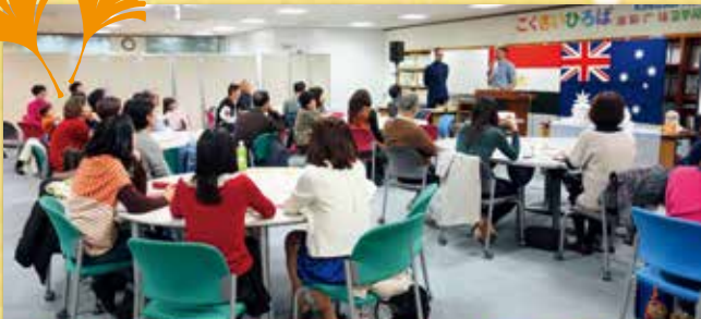
Around the World with Kokusai Hiroba Cafe Egypt & Australia

With the collaboration of various NPOs and international exchange organizations within the Prefecture, FIEF's 'Kokusai Hiroba' is home to many events that further local residents' understanding of internationalization and international exchange.