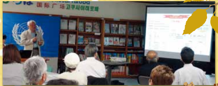
Habitat Hiroba (UN Habitat Fukuoka Regional Office)