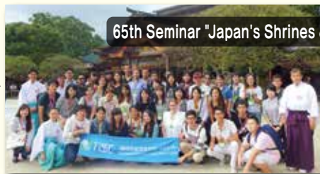
65th Seminar "Japan's Shrines & Deities - Dazaifu Tenmangu"

Being allowed inside the main shrine was an unforgettable experience!