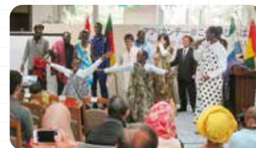
Last year's African Day

An event showcasing Africa, organized by African students from Kyushu University. In addition to Africa's continued growth in recent years, the event will also introduce a broad range of traditional music, clothing and dance from various nations.