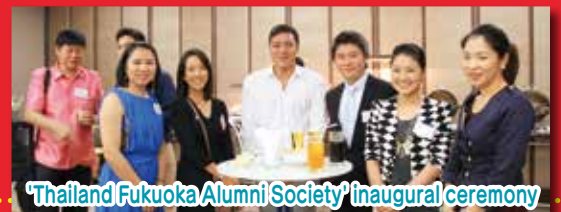
'Thailand Fukuoka Alumni Society' Inaugural ceremony

▶ FiSSC offers support for establishing former international student societies in various cities, in order to maintain the networks cultivated in Fukuoka even after returning home.