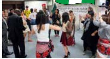
Last year's event

Kyushu's resident Nigerians introduce the attractions of their home country! With chances to dress in native clothing or join in the dancing, there is something for everyone to enjoy. Come experience Nigeria at Kokusai Hiroba!