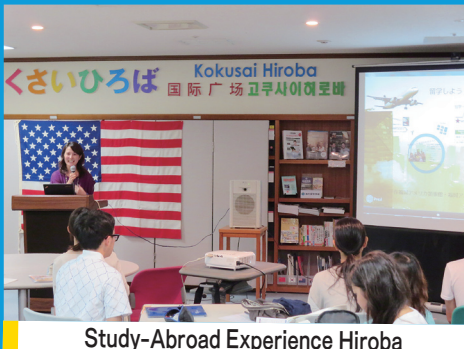
Study-Abroad Experience Hiroba - Let's go to America! (Fukuoka American Center)