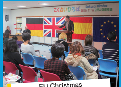
EU Christmas (Fukuoka EU Association, EUJ Kyushu)

From the Participants: Around the World with Kokusai Hiroba Cafe ~ America & South Korea!