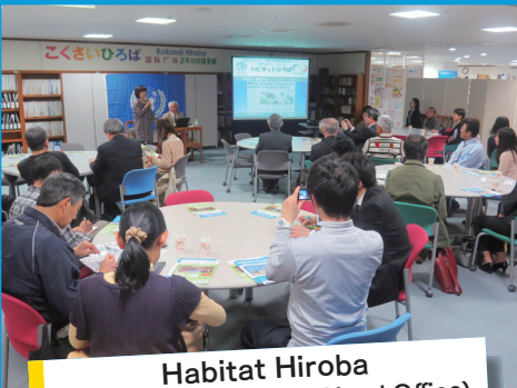
Habitat Hiroba (UN Habitat Fukuoka Head Office)