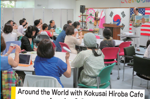
Around the World with Kokusai Hiroba Cafe - America & South Korea

In collaboration with various NPOs and international exchange organisations within the prefecture, FIEF holds events aimed at deepening understanding of cultural exchange and furthering internationalization.