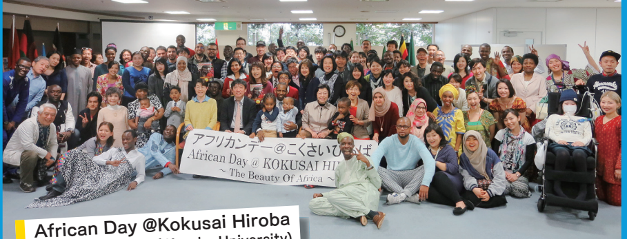
African Day @Kokusai Hiroba (African Society of Kyushu University)