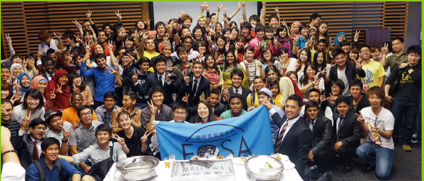
Fukuoka Overseas Students Association (FOSA) Welcome Party 2014

Together with universities, local governments and businesses within the prefecture, Fukuoka International Exchange Foundation is engaged in various projects targeted at these students. They include consultation and employment support, part time work introduction, scholarships and promotion of exchange with local residents.