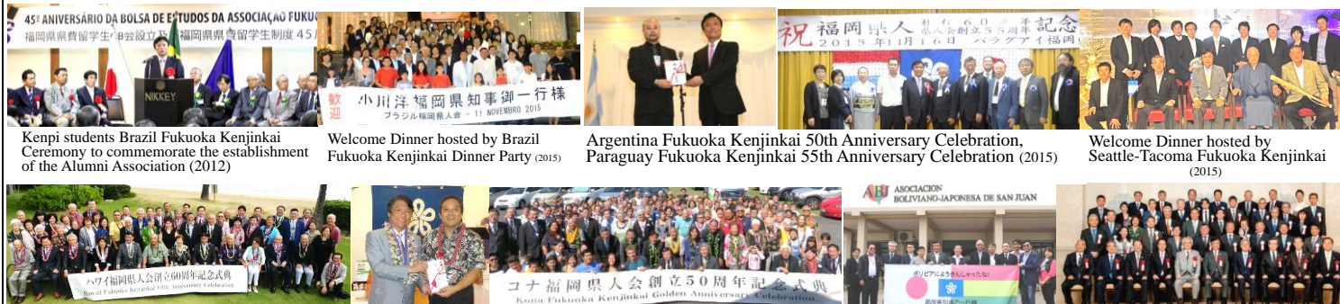
Kenpi students Brazil Fukuoka Kenjinkai Ceremony to commemorate the establishment of the Alumni Association (2012)