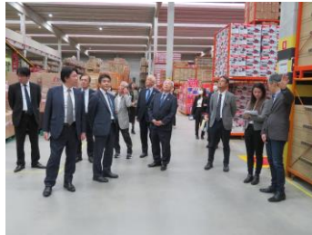
【Kenjinkai members, administration, business, and observation】