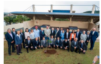
【State of Paraná, City of Assaí Asahi castle tree planting commemorative picture】