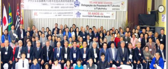
Fukuoka Kenjinkai Suzano Branch 50 year establishment anniversary (7/22/2018)