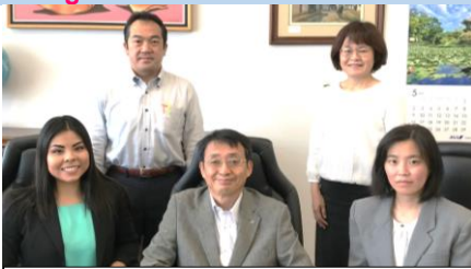
Their first visit at the Foundation