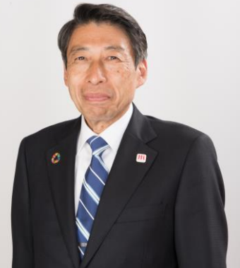
Governor Seitaro Hattori