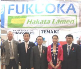
Japan Matsuri Brazil Fukuoka Kenjinkai Booth (7/21/2018)