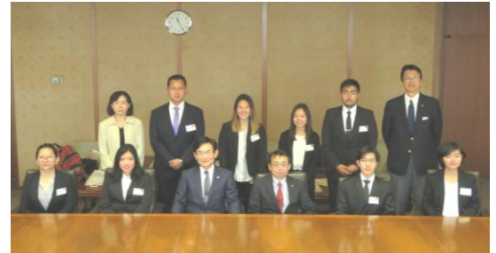
【Commemorative photo with Vice Governor Eguchi】

On 17 th of May, they paid a courtesy visit to Fukuoka Prefecture Vice Governor Eguchi, where they received some words of encouragement: "I look forward to witnessing your great improvements since all 8 of you will be studying and competing with each other. I am also hoping to see your active performances acting as the exchange bridge that will connect Fukuoka Prefecture with different regions in the future."